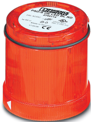
LED blinking light element, 24 V AC/DC, red

Please be informed that the data shown in this PDF Document is generated from our Online Catalog. Please find the complete data in the user's documentation. Our General Terms of Use for Downloads are valid ( http://phoenixcontact.com/download )